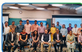
ABCS OF MEDICAL DEVICES AND IVDS COMMERCIALIZATION JOURNEY

OPEN-ACCESS PUBLISHING AND RESEARCH EVALUATION: INSIGHTS FROM G20 SIDE EVENT