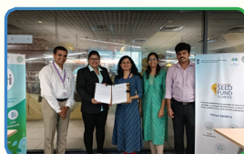
RICH DRIVES INNOVATION THROUGH SEED FUNDING SUPPORT TO LIQSURE AND RNA BIOTECH